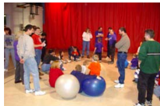
Pioneers Induction Ceremony

Children whose parents are involved in their lives are more confident and less anxious in unfamiliar settings, are better able to deal with frustration, better develop a sense of independence, are more likely to become compassionate adults, have higher self-esteem, have higher grade-point averages, and are more likely to be sociable.